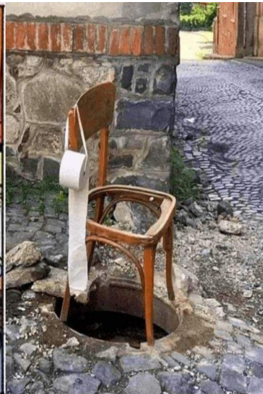
Guaranteed Clog Free Toilet